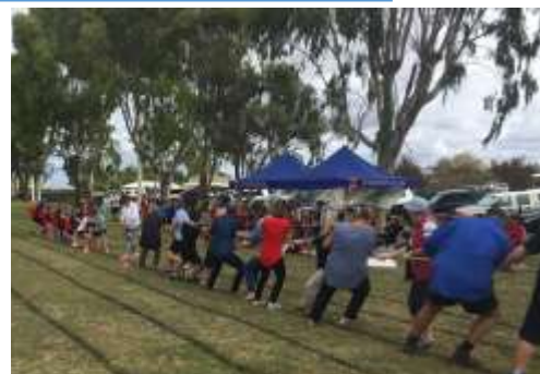
Tug-O-War—Try as we may, the parents were just too good!